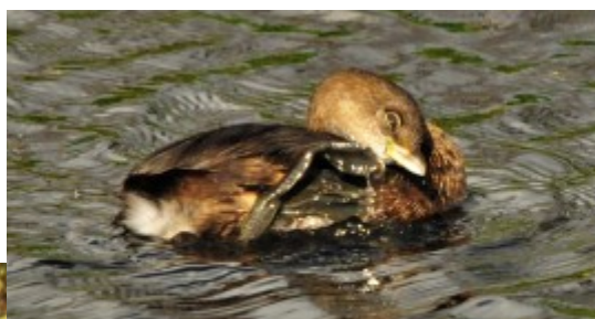
At Lake Apopka North Shore

https://www.signupgenius.com/go/20F044EA9A92CA3FF2-2022