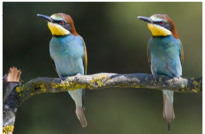
European Bee-eaters, Merops apiaster

Birds & Nature Tours Portugal (+351) 913 299 990 joao.jara@birds.pt